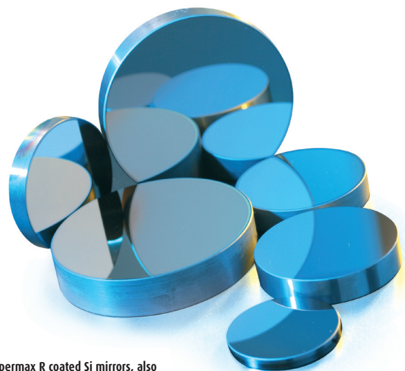
2 | Supermax R coated Si mirrors, also available on Copper and Silicon Carbide. Dual Band version available on Cu and Si for visible wavelengths.