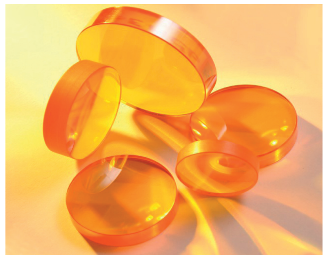
1 | UltraLO coated ZnSe lenses.

There is a Dual band version available on Si and Cu for visible beam alignment. Reflectance at the visible wavelength > 75%.